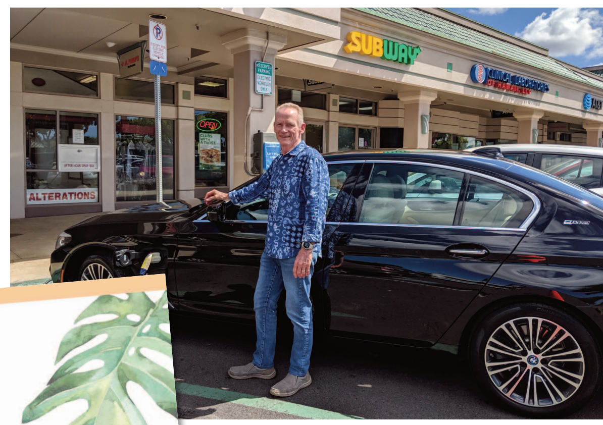
Kapolei Shopping Center SUSTAINABILITY SAT. JUNE 29 | 10AM - 1PM Electric vehicle showcase EV ride-and-drive

awai'i is the most fossil fuel dependent state in the nation, and has set an aggressive goal of achieving 70% clean energy by 2030 and 100% by 2045 through renewable energy and energy efficiency. It's a massive undertaking that requires statewide participation in a variety of targeted clean energy initiatives. Kapolei Shopping Center is putting a spotlight on one particular initiative — promoting the use of electric vehicles (EVs and plug-in hybrids) in West O'ahu at its Sustainability Fair on Saturday, June 29, from 10 a.m. to 1 p.m.