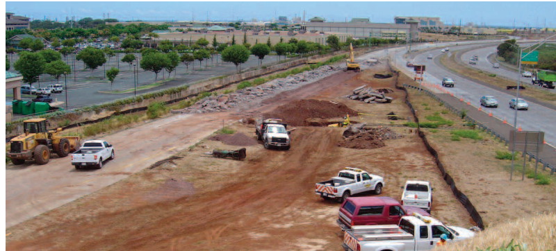
(Facing west) "Exit 1B" at Wakea St.