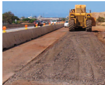
(Facing west) The new H-1 westbound on-ramp from Makakilo Drive.