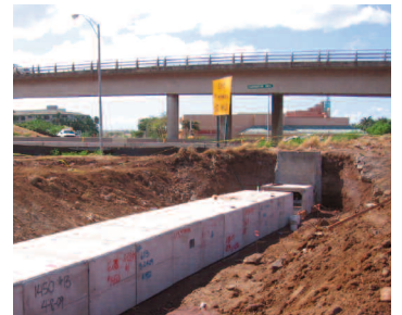
(Facing south) The new H-1 westbound off-ramp to Farrington Highway.