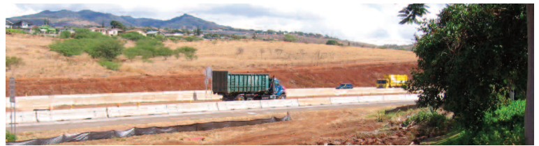
(Facing east) The new H-1 eastbound on-ramp.